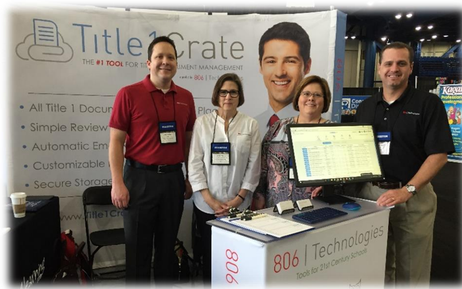
Leadership Team (L-R)