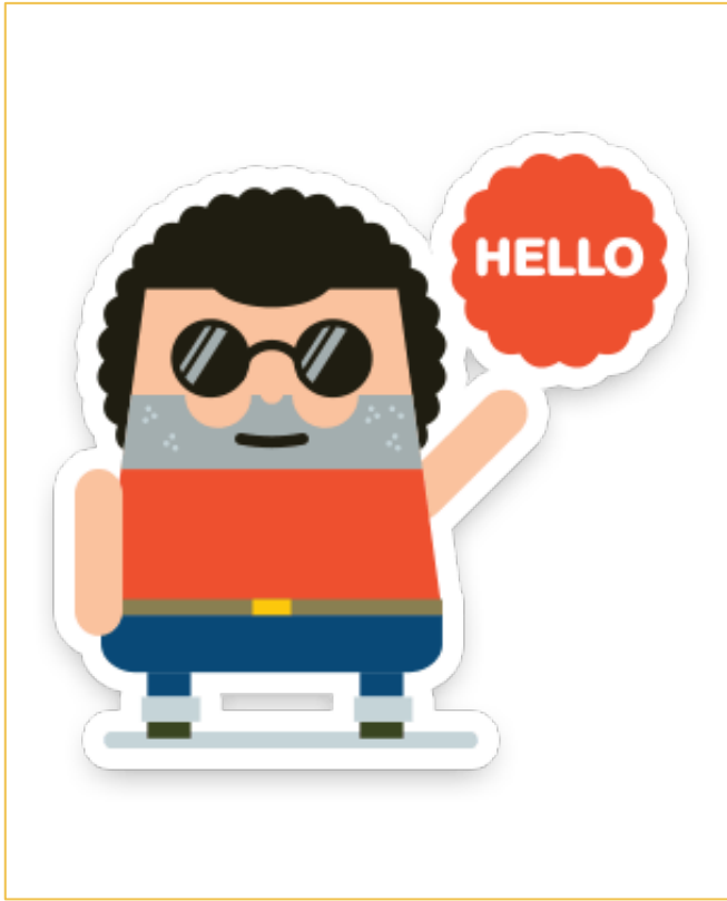
Vacant Education Associate