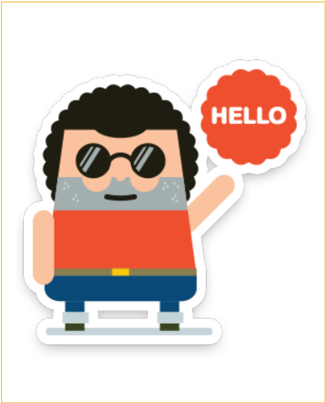
Vacant Education Associate