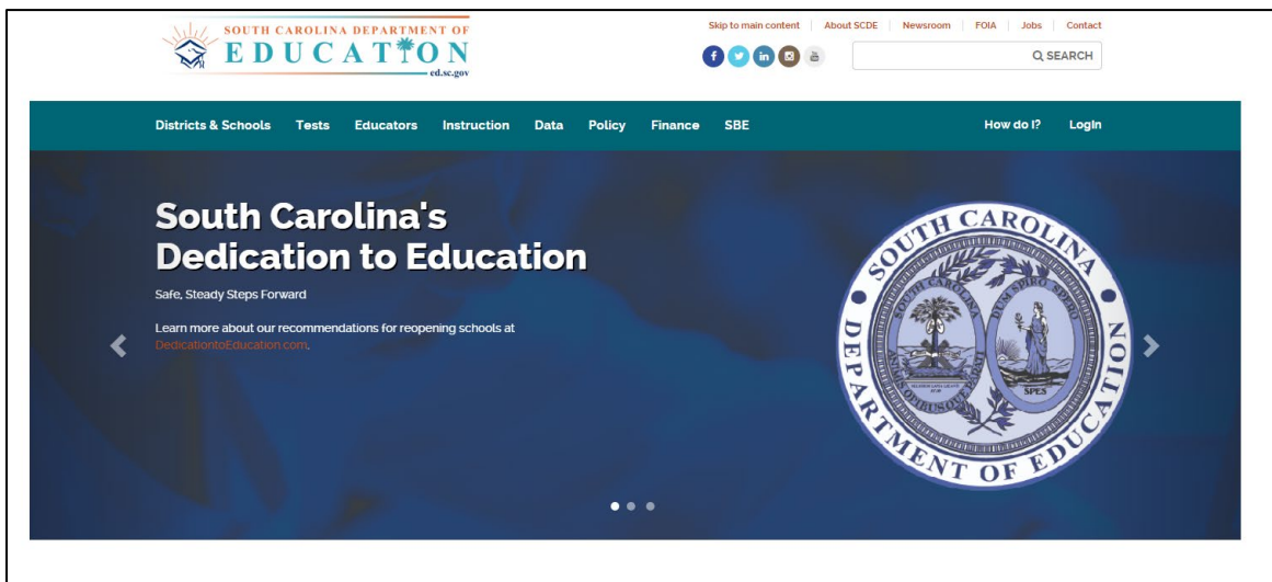
(Figure 1 - South Carolina Department of Education Website)