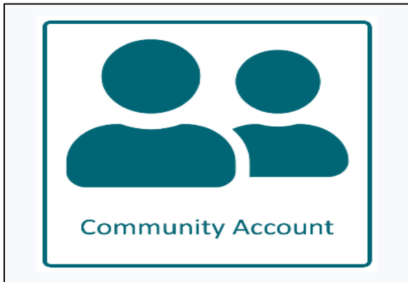
(Figure 4 - Member Services User Signup)